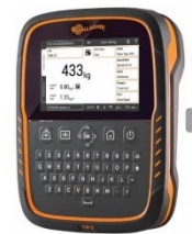
TW-3 Weigh Scale & Data Collector

Home / Animal Management / Weighing and EID / Weigh Scales and Data Collectors / TW-3 Weigh Scale & Data Collector